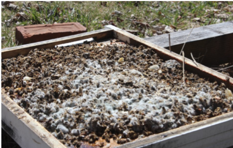
Figure 4. Picture of the bottom board taken from the only dead control colony on March 1 st , 2013. The volume of dead bees was estimated to be 3.5 l using 1-L graduate cylinder using Atkins (1986) method.

might be due to the fact that the daily average temperature was lower in 63 of 91 days in the winter of 2010/2011 than of 2012/2013. The overall average temperature in the winter months was -3.8\text{ }^{\circ}\text{C} ( 25\text{ }^{\circ}\text{F} ) in 2010/2011, approximately 2.78\text{ }^{\circ}\text{C} ( 5\text{ }^{\circ}\text{F} ) lower than in 2012/2013.