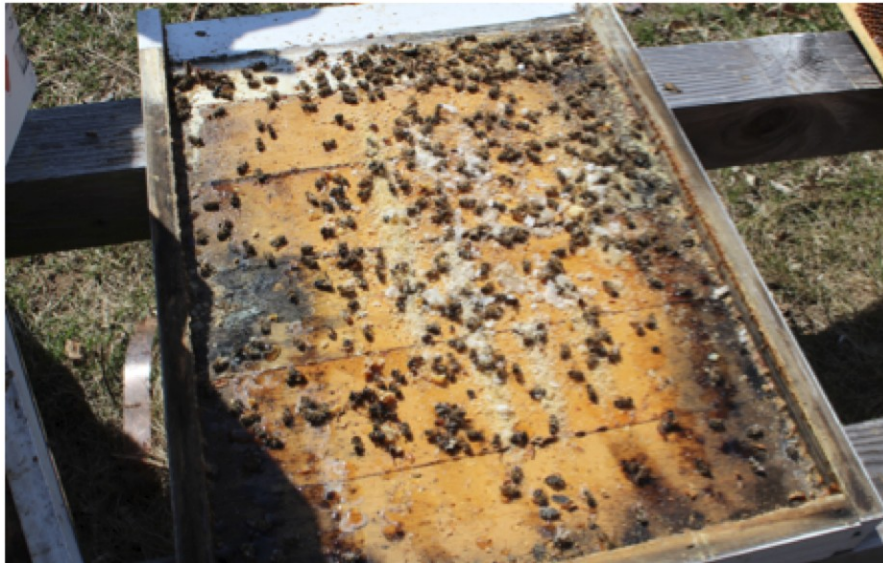
Figure 3. Picture of the bottom board taken from one of the dead neonicotinoid-treated colonies on March 1 st , 2013. The numbers of dead bees in the six dead CCD colonies ranged from 200-600 dead bees.