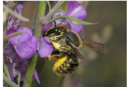
A female Wool-carder Bee at Purple Toadflax flowers