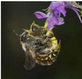
A mating pair