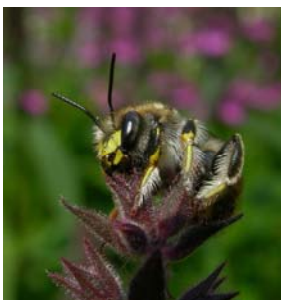
An exhausted and injured male after a territorial dispute with another male