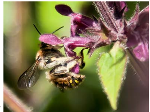
A male Wool-carder bee showing abdominal spines